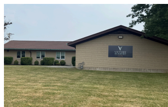
Victory Academy at Nelson

Main Office: 716-828-9737 Nurse's Office: 716-828-7969