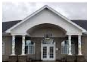
Victory Early Childhood at Monarch