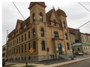
Victory Early Childhood at St. John's

Main Office: 716-828-7607 Nurse's Office: 716-828-7686