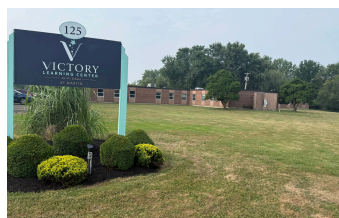
Victory Learning Center at Martin

Main Office: 716-828-9716 Nurse's Office: 828-