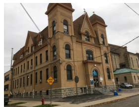
Victory Academy at St. John's

Main Office: 716-828-828-9560 Nurse's Office: 716-828-9368