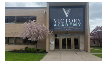
Victory Academy at Ridge

Main Office: 716-828-828-9560 Nurse's Office: 716-828-9368