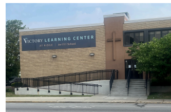
Victory Learning Center at Ridge

Main Office: 716-828-7701 Nurse's Office: 716-828-7708